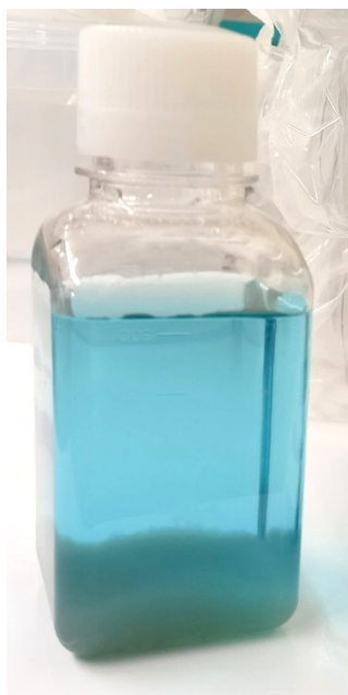
Photo 2. 500x stock of trace elements