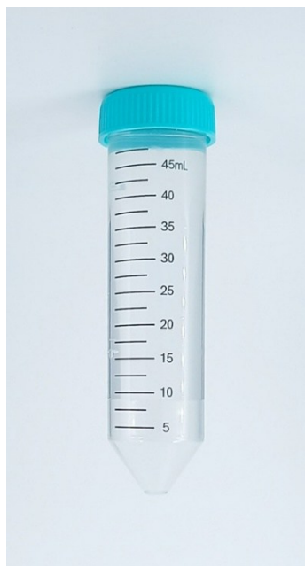
Photo 1. 1x BBM solution, unfiltered

Preparing 1L of 50x BBM solution yields approximately 4g (dry weight) of precipitate (see photo 3, 50x BBM stock, unfiltered). If performing strictly quantitative cultivation, the user can use such retentate to prepare a 300 mL concentrated suspension and autoclave (Autoclave is acceptable because the compounds in the retentate are non-temperature-sensitive). Use 1/300 volume of this suspension together with the 50x stock, and make 1 L of 1x BBM medium solution.